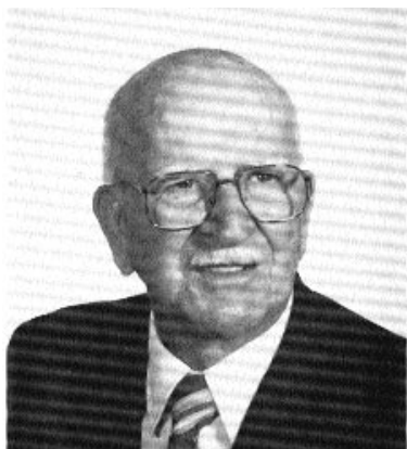
Hiram Lodge No. 21, A.F.&A.M.

Born: January 27, 1912 Entered: January 25, 1951 Passed: April 4, 1951 Raised: May 24, 1951 Worshipful Master: June 4, 1964 Grand Marshal: October 6, 1966 Senior Grand Warden: October 6, 1970 Deputy Grand Master: October 8, 1983 Grand Master: October 6, 1984 Called from labor: June 27, 2002